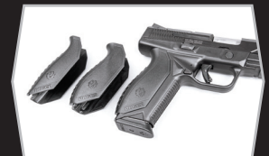
Modular Wrap-Around Grip System for Adjusting Palm Swell and Trigger Reach