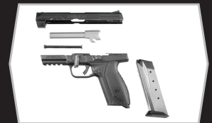
Safe, Easy Takedown with No Tools or Trigger Pull Required