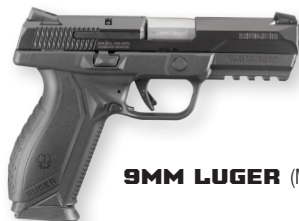
9MM LUGER (Model 8605 Shown)