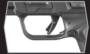
Short Takeup Trigger with Positive Reset