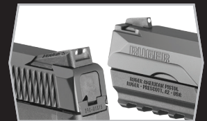
Genuine Novak® LoMount Carry Three-Dot Sights