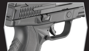
Ambidextrous Slide Stop and Magazine Release Allow Actuation with Either Hand