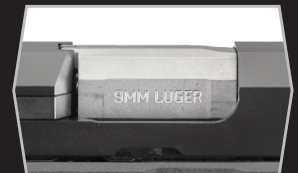
Performance Tested for Sustained +P Ammunition Use