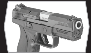
Recoil-Reducing Barrel Cam, Low Mass Slide, Low Center of Gravity and Low Bore Axis